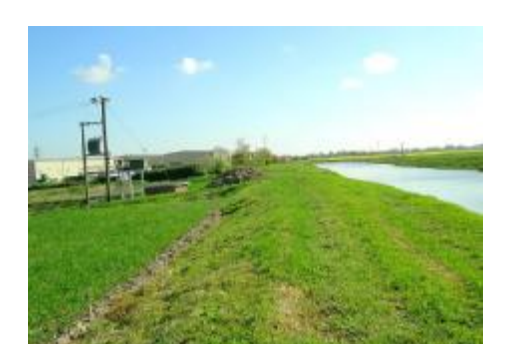
Carry on round Fox's boatyard.